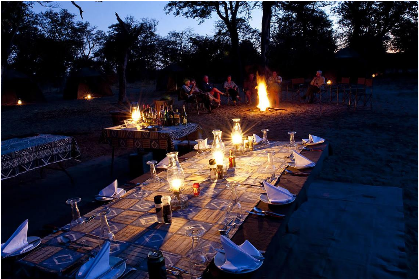
Dinner setting with the 'boma' (fire) behind