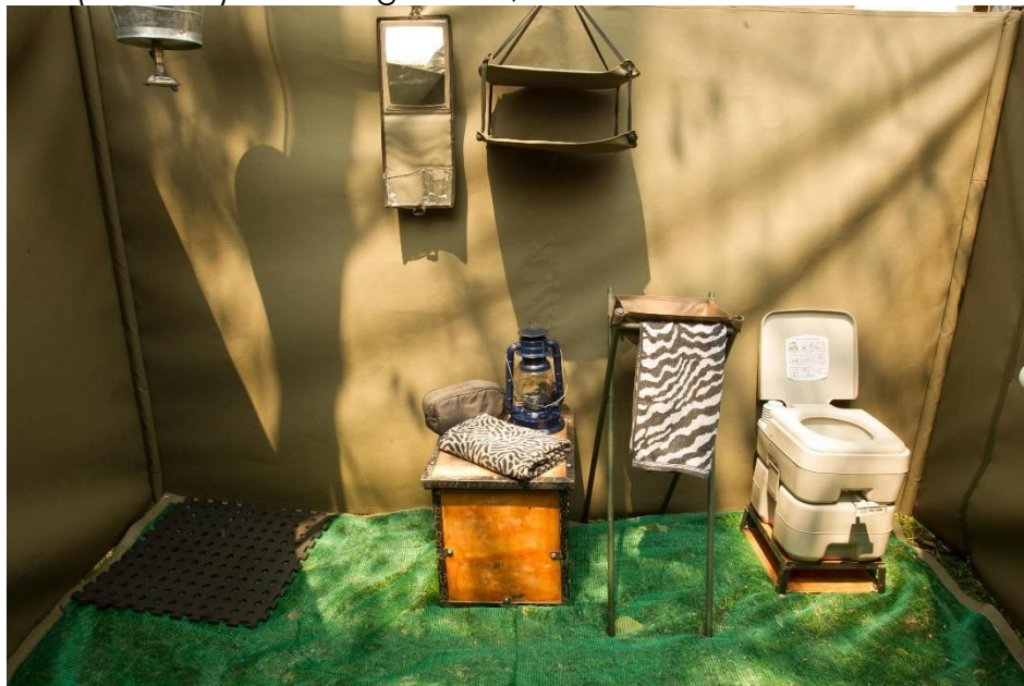
Bush bathroom with bucket shower and (usually) a chemical toilet