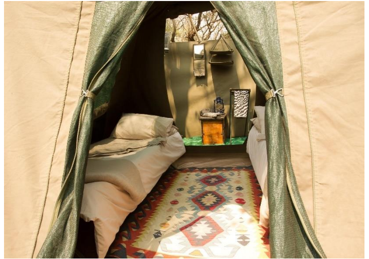
Standard dome tents (3m X 3m) with 2 single beds, bed linen and towels. Ensuite attached at rear.