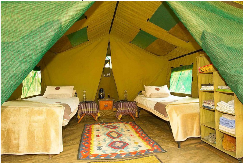
Luxury tent with ensuite

Shorter safaris are available with scheduled departures and as private safaris. Please enquire