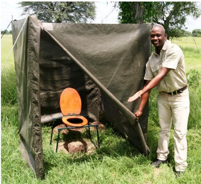
TENTS & ABLUTIONS (BUSH SHOWER & LOO) FOR SEMI-PARTICIPATION SAFARIS